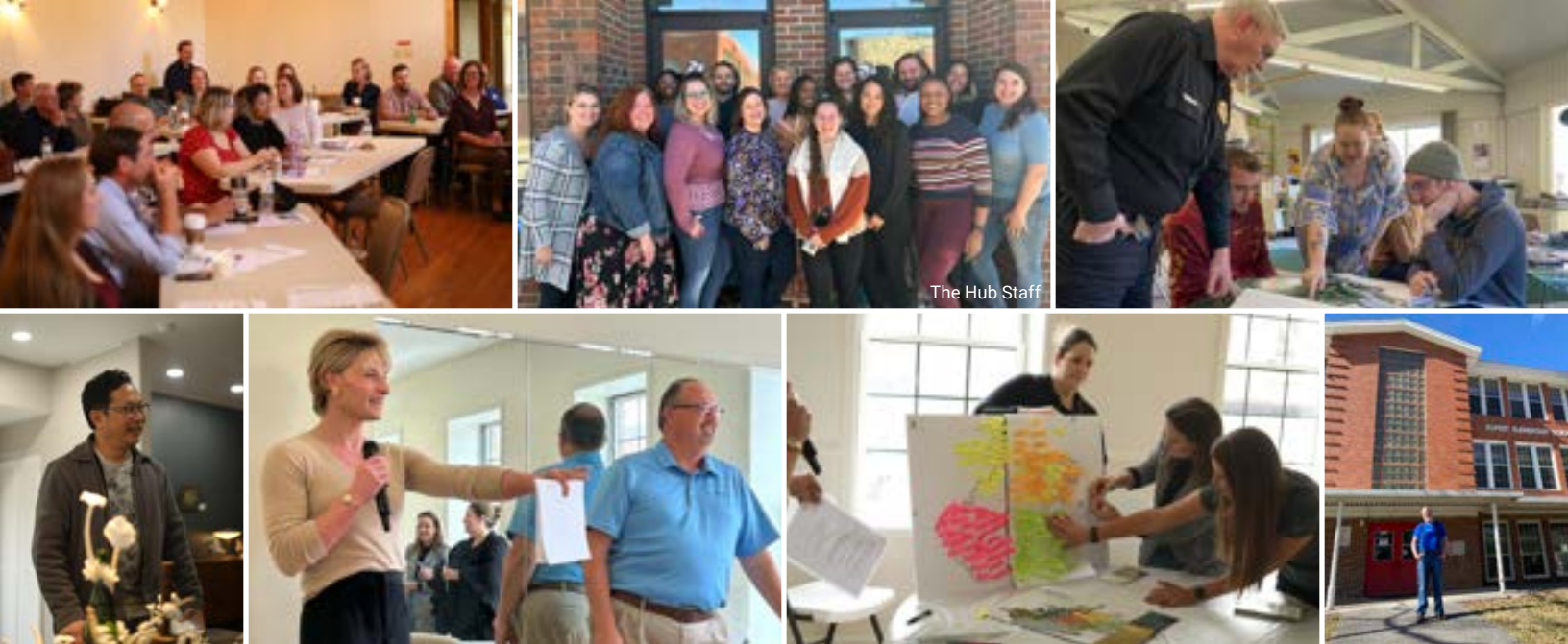
The Hub Staff