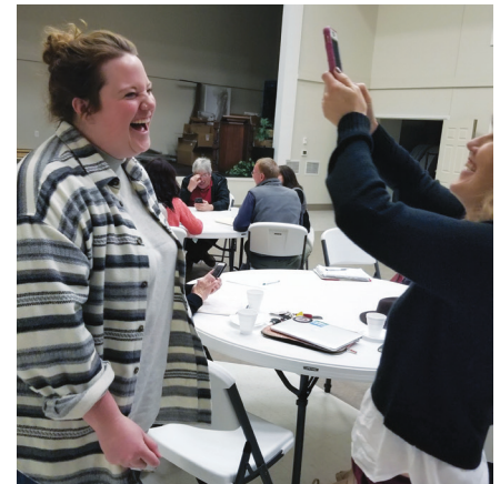
Moorefield residents participate in a storytelling workshop as part of Cultivate WV

The Hub launched new major initiatives across all four approaches to the organization's work: Cultivate WV supports low-capacity, low-resourced communities to kickstart revitalization efforts through organizing multiple local teams to complete dozens of community development projects in each community in one year; the Blueprint Communities program, in partnership with the Federal Home Loan Bank of Pittsburgh, supports cross-sector community teams to build strategies to make a lasting impact on the economic well being and quality of life for their fellow residents; the Next Generation Communities Project , in partnership with Generation WV, supports community teams to identify and implement local policies that will create economically vibrant towns that are inviting to young people; the statewide Community Development Think Tank and supporting efforts are reorganizing and catalyzing the state's Community Development Network to level-up efforts over the next 10 years; and #NewStoryWV creates an accessible, participatory movement to capture positive stories of work happening on the ground in West Virginia.