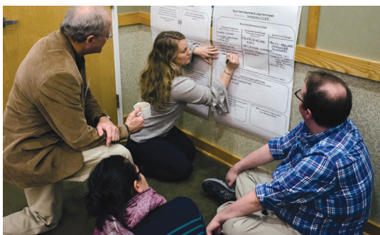
Participants at Community Development Think Tank

Members of the Abandoned Properties Coalition successfully created and kickstarted a coalition strategic plan (including convening a steering committee and adopting bylaws) and formed a team to oversee coordination to successfully transition the coalition to the WVU BAD Buildings Program over the next two years, enabling an increase in the impact and sustainability of the group.