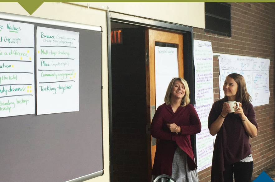
Abandoned Properties Coalition members gather to formulate strategic plans