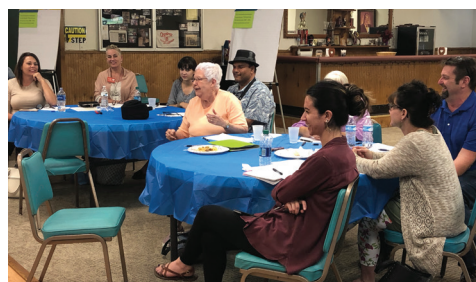
Grafton residents participate in a conversation to celebrate and strengthen community development efforts

Community teams in Grafton and McDowell County secured major gifts to support their work, including a $50,000 bequest for All Aboard Grafton and a $55,000 donation from an anonymous donor to support the new Jack Caffrey Arts and Culture Center in Welch.