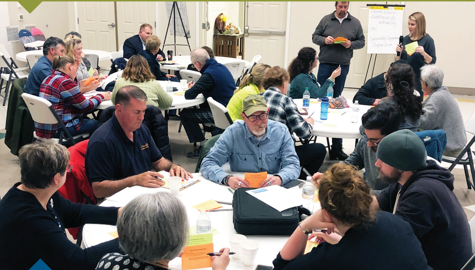
Moorefield residents participate in a Cultivate WV community meeting