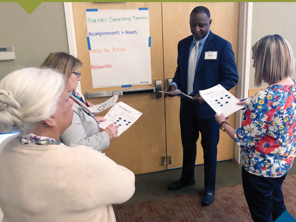
Blueprint Communities participants gather for kickoff conversation