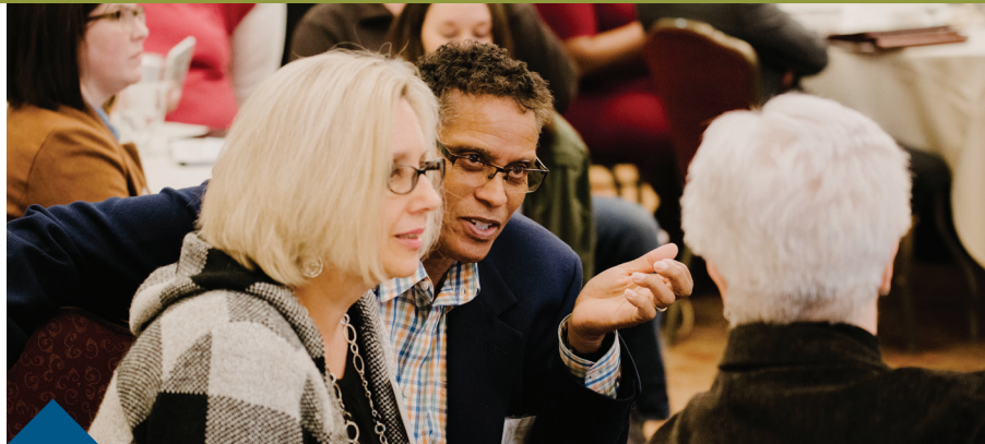
Participants converse at Community Development Think Tank

More good news is to come on this initiative as we continue our efforts in earnest to support building a stronger network amongst community development practitioners in the state.