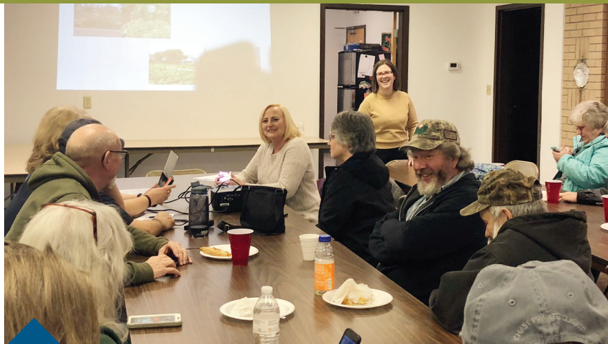
Cultivate WV's Cowen residents participate in a storytelling workshop

We're working together to document a story that shows the innovation, perseverance, and grit that is the true spirit of West Virginia. Everyone is welcome to come on board—find out more at newstorywv.org .