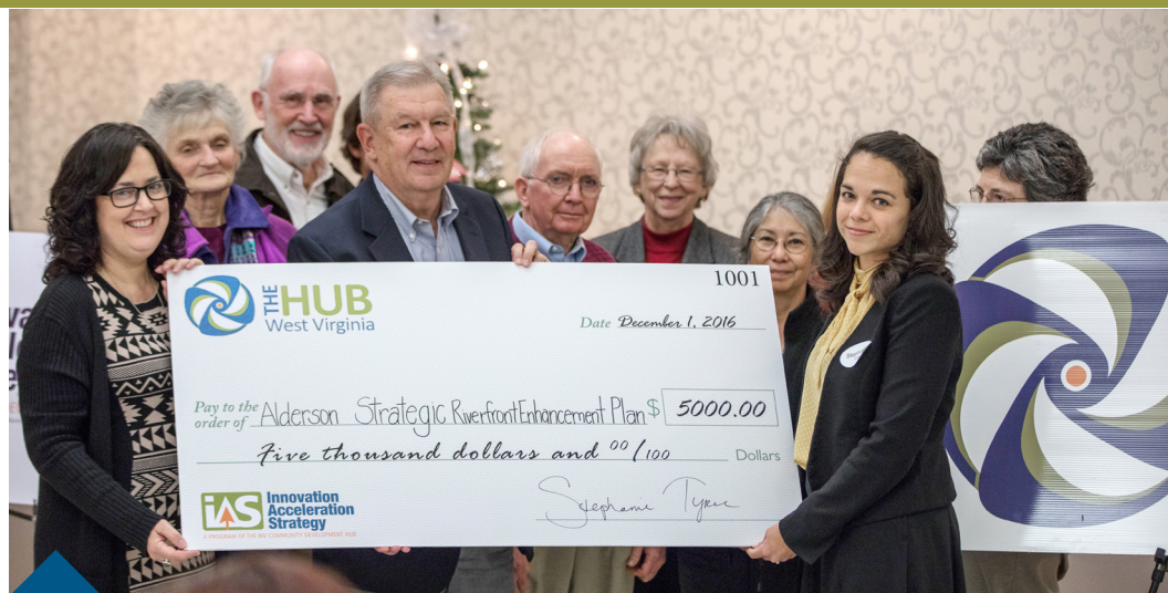
Alderson team accepts top award with Hub Executive Director.

Building on the success of Bucks for Bright Ideas, The Hub rolled out a non-competitive mini-grant program for the Innovation Acceleration Strategy program communities that has invested more than $30,000 into similar projects around the state. The initiative was generously funded through the Claude Worthington Benedum Foundation and The Greater Kanawha Valley Foundation.