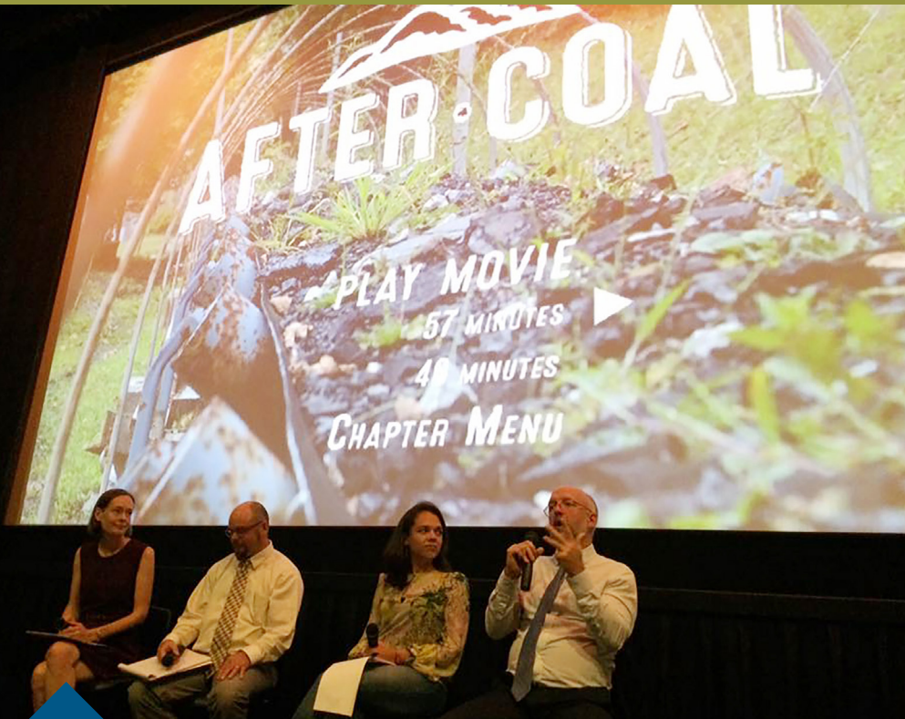
Hub Executive Director speaks at a panel in Washington, DC with representatives from the Sierra Club and White House.