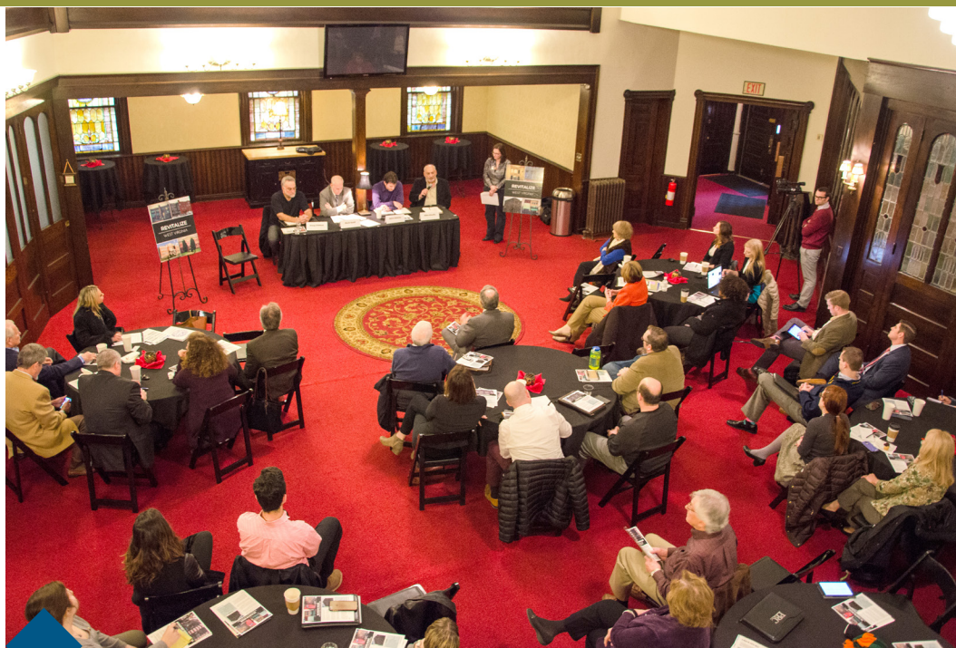
Historic tax credits public education meeting in Fairmont.

The state historic property tax credit bill passed out of both the House and the Senate during the regular session but died in conference committee on the last day. The momentum and widespread support this policy received in its first year of introduction is a testament to the great value that West Virginians place on revitalizing their downtowns. The Coalition has already begun plans to reinvigorate this effort for the 2018 legislative session.